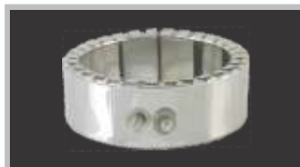
Ceramic Band Terminations (Screw Terminals)