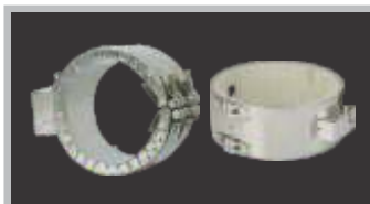
Ceramic Band General Purpose Terminal Boxes