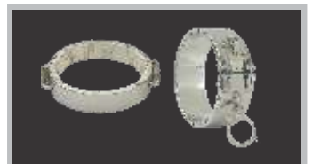
Ceramic Band Heater With Inside SS Cover

Warehouse #G1-33, Gate No.1, Ajman Free Zone, Ajman, (U.A.E).