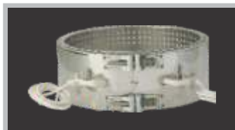
Ceramic Band Clamping Variations Spring Loaded